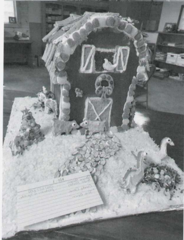
Respectfully submitted by Christine Pouch, 12/8/2022